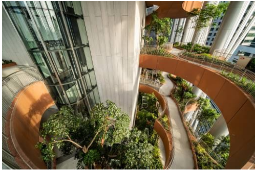
Photo 5 - Executives can take in fresh air outdoors while enjoying panoramic views in the mid-air gardens at Green Oasis, then work-from-anywhere within CapitaSpring by tapping on the latest WiFi 6 technology.