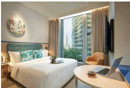
Photo 8 - The 299-unit serviced residence Citadines Raffles Place Singapore opens as the new flagship for Citadines Apart'hotel, managed by The Ascott Limited.