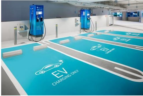
Photo 11 - To provide more green mobility options, CapitaSpring has four electric vehicle parking lots, two of which are equipped with direct 50kW current fast chargers.