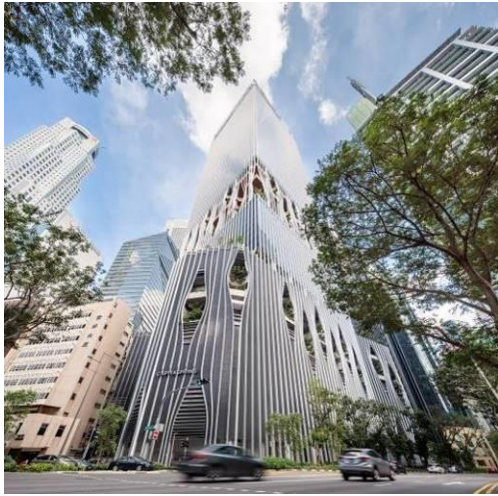
Photo 1 - CapitaSpring, the 51-storey integrated development at 88 Market Street, is the only Grade A office development in Singapore's prime Raffles Place Central Business District (CBD) completed in 2021.