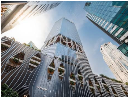
Photo 2 - CapitaSpring's façade features a lively interplay of orthogonal pin-striped fins in its sleek aluminium façade, both unifying and revealing pockets of green terraces and communal spaces at multiple elevations.