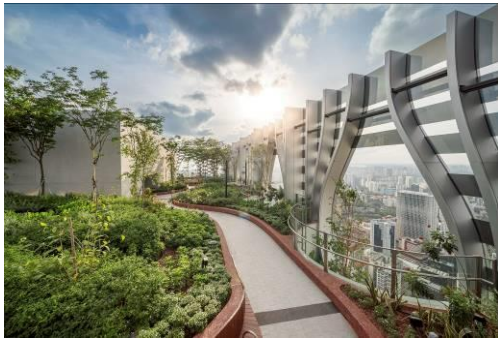
Photo 6 - At 280 metres above ground, the Sky Garden at level 51 features Singapore's tallest publicly accessible observatory deck offering 360-degree scenic views of Marina Bay and CBD.