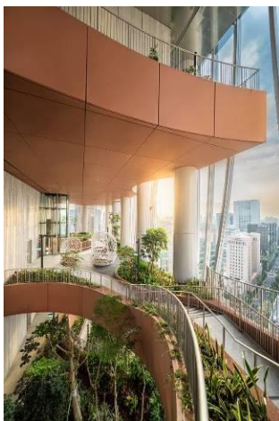
Photo 4 - Besides being home to over 38,000 plants, the Green Oasis offers a variety of work-live-play amenities such as an amphitheatre, a yoga alcove, jungle gyms, ideation nests, work pods and a café.