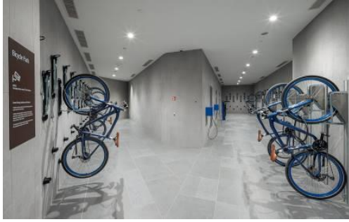
Photo 10 - CapitaSpring incorporates a rich array of amenities to promote active mobility in the CBD, including 165 bicycle lots and fully-equipped end-of-trip facilities.