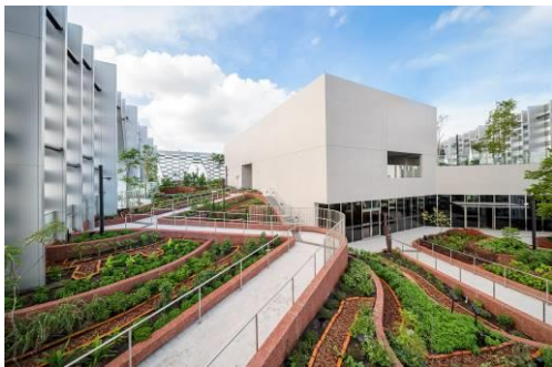
Photo 7 - CapitaSpring has partnered Edible Garden City to build Singapore's tallest urban farm, which has five different themed gardens.