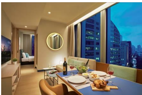
Photo 9 - The serviced residence comprises studio, one- and two-bedroom units (pictured) as well as loft apartments.