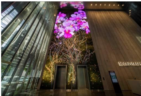
Photo 12 - Greeting visitors at the lobby of CapitaSpring is a dynamic artwork of vibrant florals on an 18-metre-high media wall by renowned international art collective teamLab.